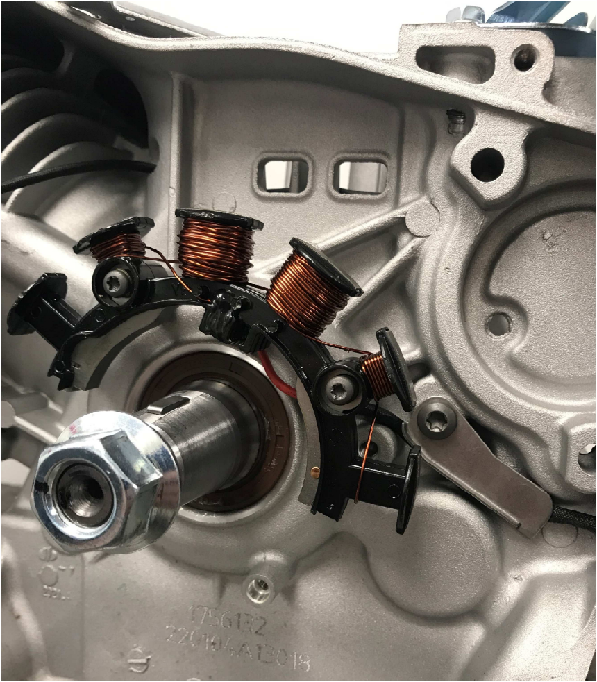
3 amp charging system